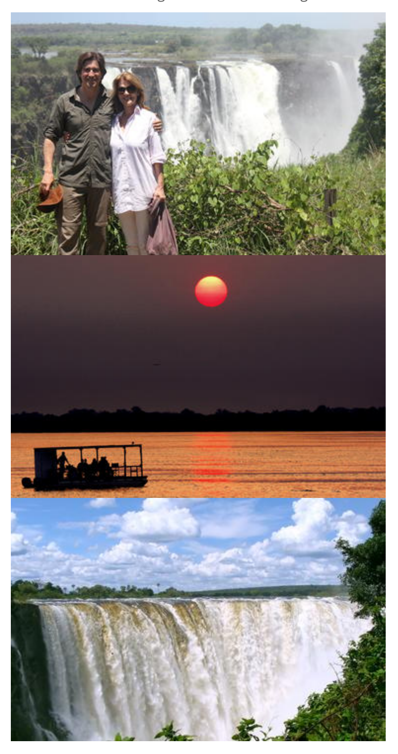
ACTIVITIES AND SERVICES Victoria Falls Tour Sundowner cruise