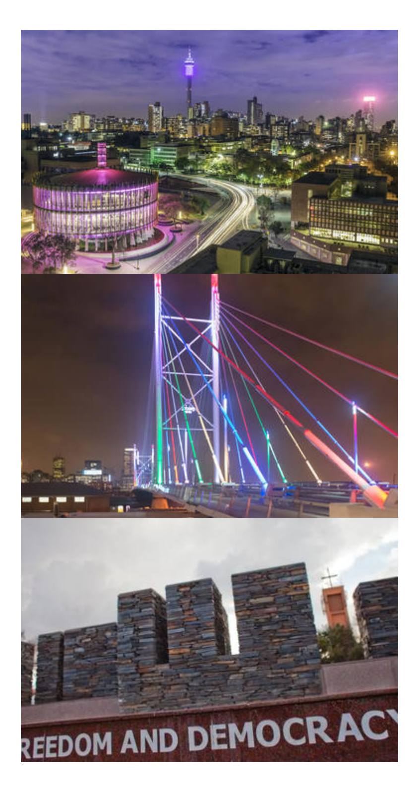
DAY 11: JOHANNESBURG